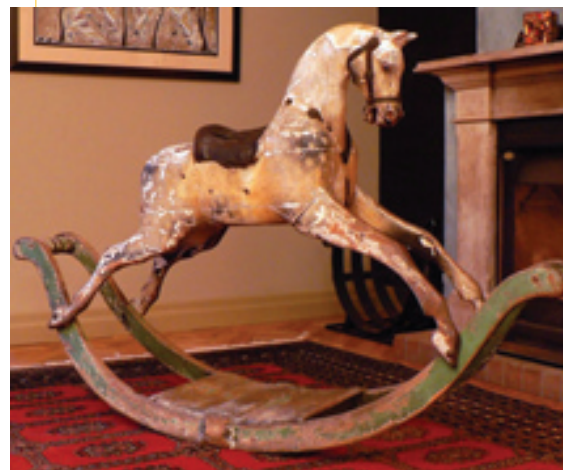
Although tatty and in need of extensive repair, this early bow rocker is still valuable and beautiful. He will be stunning after restoration.

So what should you look out for when you're thinking about adding a rocking horse to the family? The first consideration, says Sasha, is to decide what you want to do with the horse. Will it be used by children and sold when they grow up? Or do you want it to become a family heirloom? Is it for decorative purposes only, or are you looking for something that can be expected to increase in value? Are you planning to start a collection