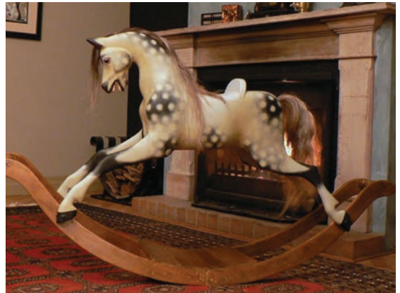
Above: Legolas, an early Lines bow, fully restored in 2012. Value: $5500-6000. Opposite, top: Edmund is a Lines Bros Sportiboy and a wonderful choice for those who want an old English horse but don't have the budget for a premium antique. Value: around $3500.