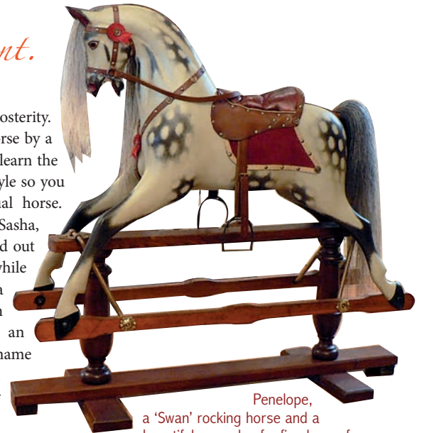
Penelope, a 'Swan' rocking horse and a beautiful example of a fine horse from a less well-known maker. Value: $5000-6000.