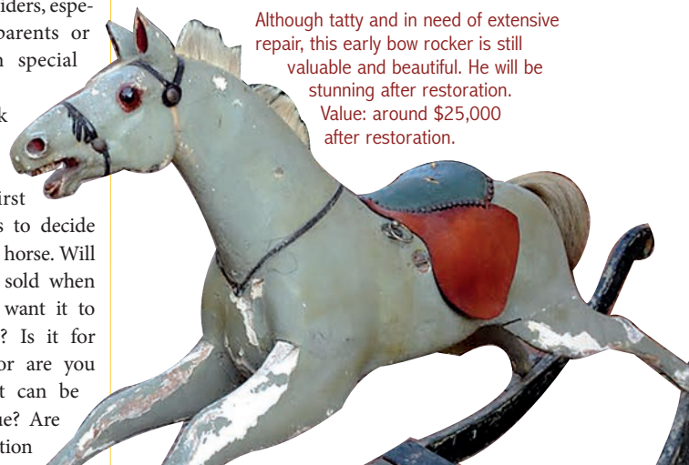
Value: around $25,000 after restoration.