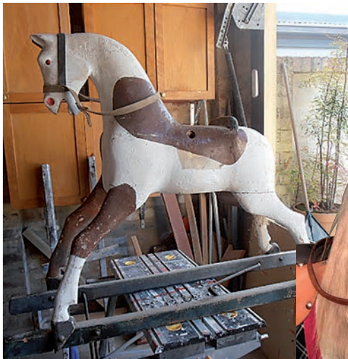
Left: Jemima, a No. 3 Roebuck c.1910, starting restoration. Below: Jemima with hand dappling in the style of the original finish. Value: around $3500.