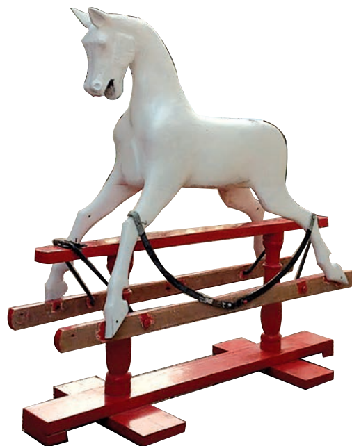
Above: Every rocking horse collector or restorer's dream is to have something not previously known about and restoration has just started on one such fascinating rocking horse: a No. 6 Roebuck that was originally a three-seater, with seats mounted to the ends of the swinging mechanism.