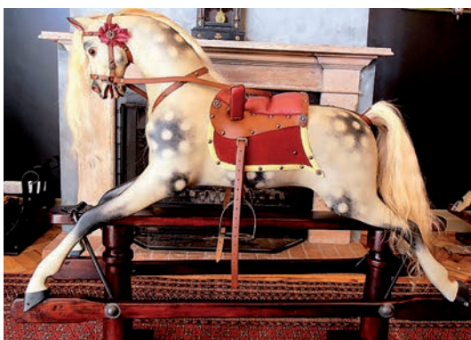
Sixpence, a G & J Lines who was fully restored in 2011. Value: $5000-6000.