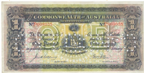
Left: 1913 £1 Front: Australian Coat of Arms and British Royal Crown. Right: 1913 £1 Back: Victoria Quartz Gold Mine, Bendigo.